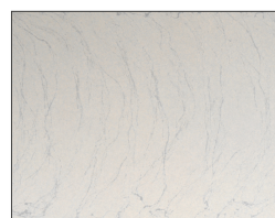
COVERAGE TOO LIGHT