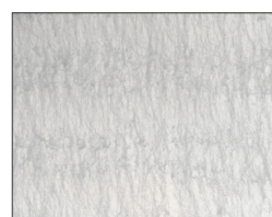
CORRECT APPLICATION = 20 dry gms/sqm